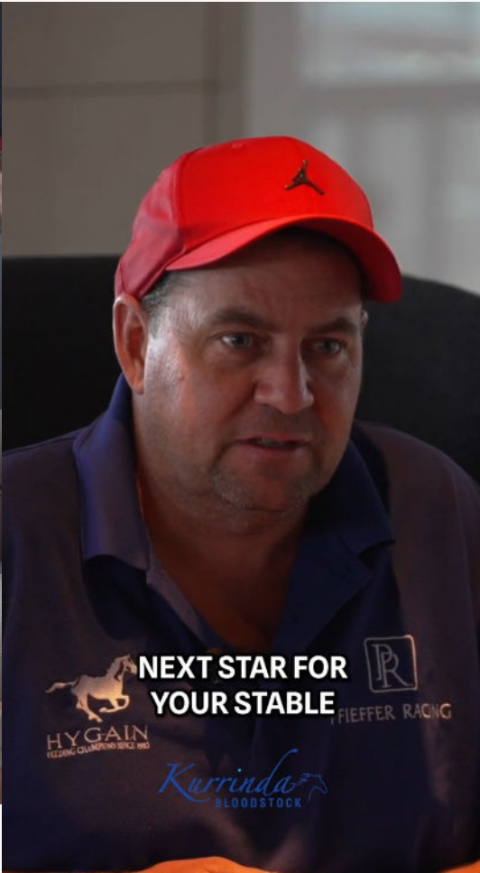
NEXT STAR FOR YOUR STABLE