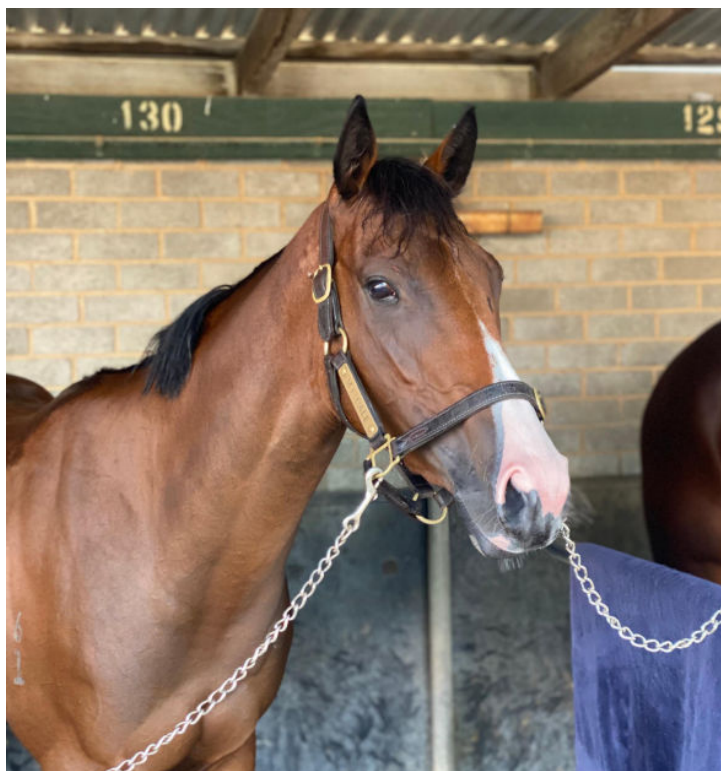
Eyes on the prize for Satin Stiletto